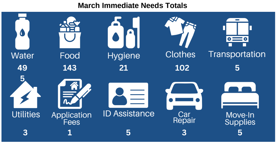
*To learn more, visit www.5CHC.org